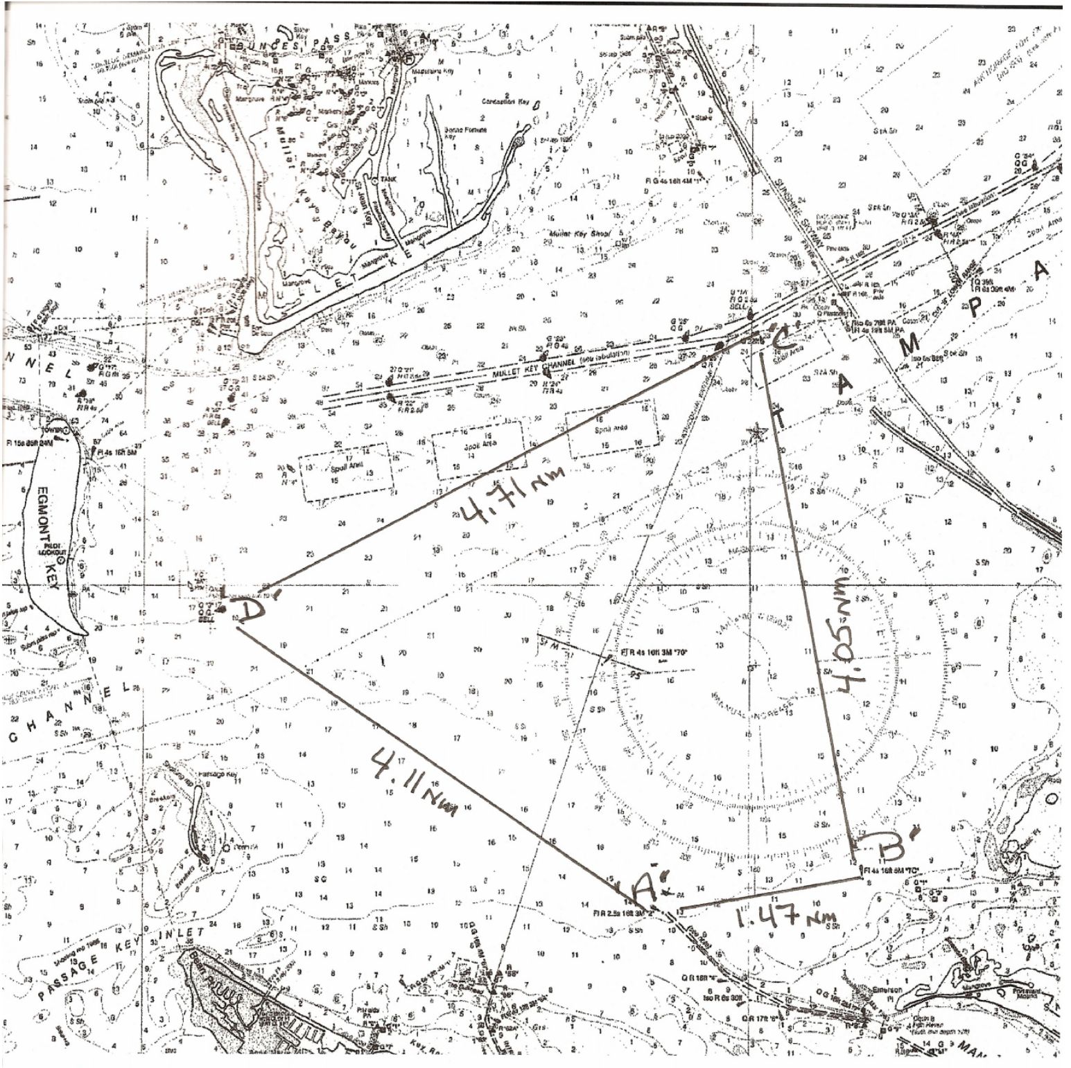
Diagram B is not to be used for Navigation See Appendix 1 for Courses